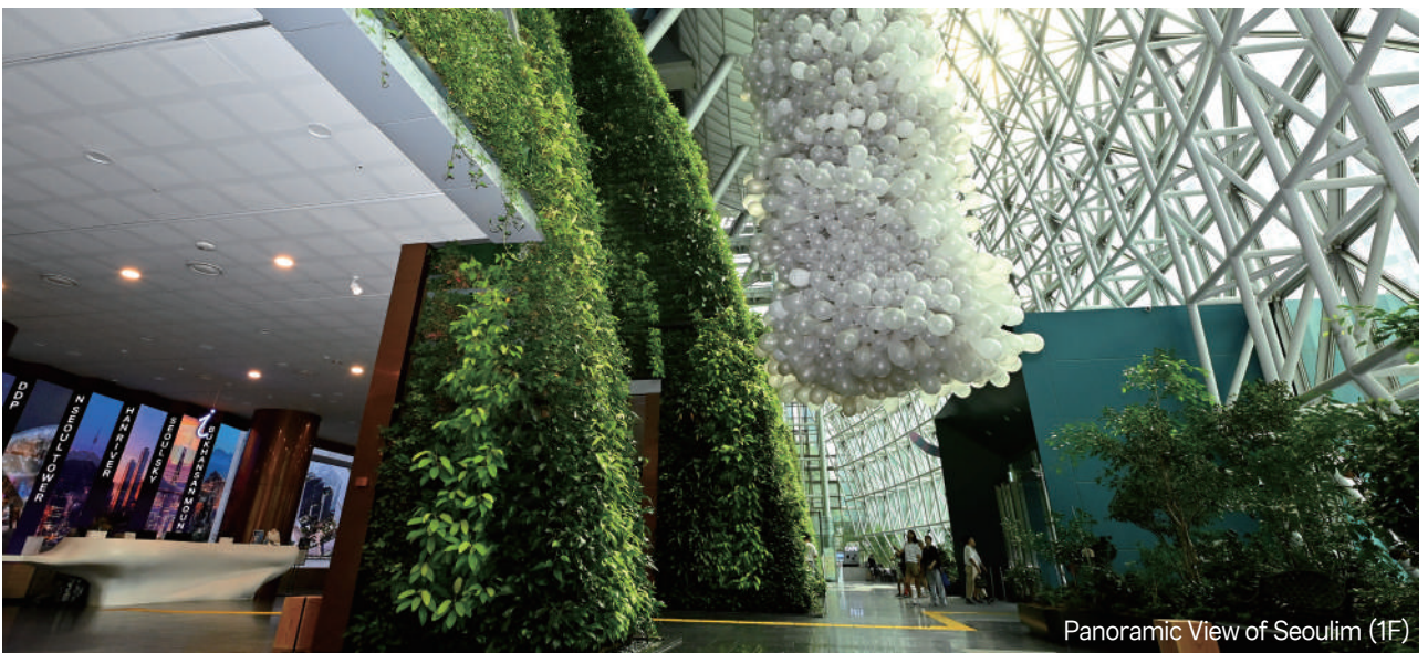
Panoramic View of Seoulim (1F)