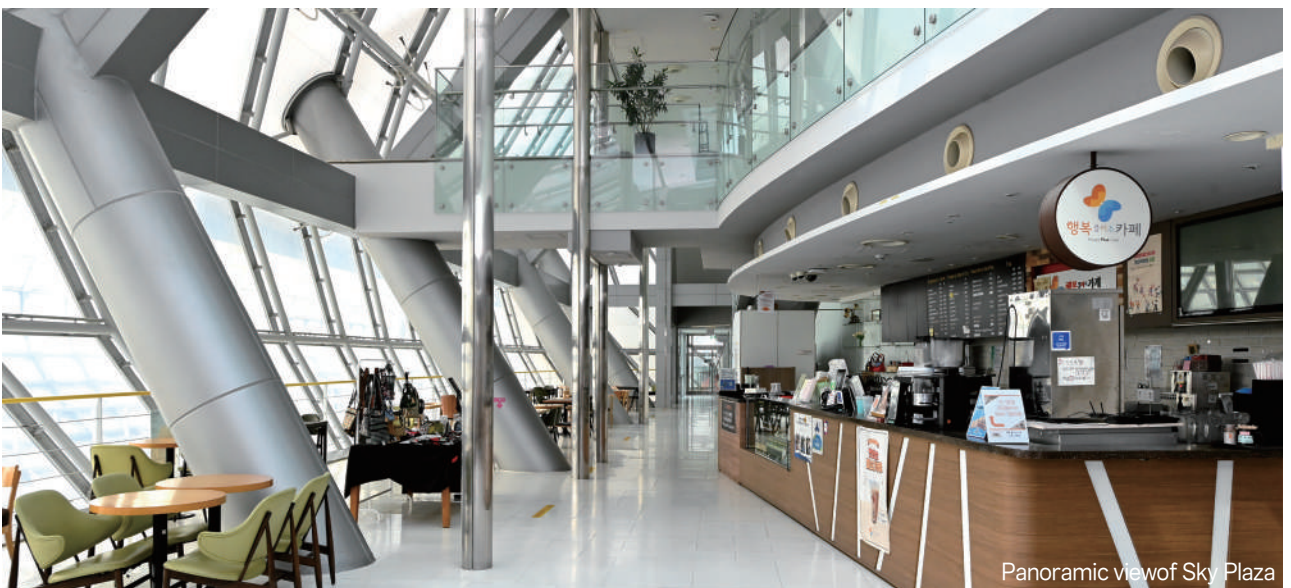
Panoramic view of Sky Plaza