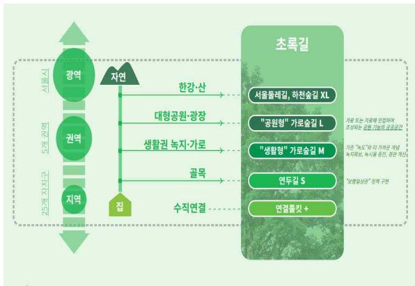
<Concept of Seoul Green Trails>